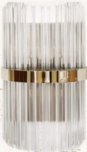
WALL LIGHT 9165.30

DIMENSIONS: H.35CM - Ø.100CM WEIGHT: NET 40KG BULBS: 24X G9 (3W) MATERIAL: BRASS & GLASS