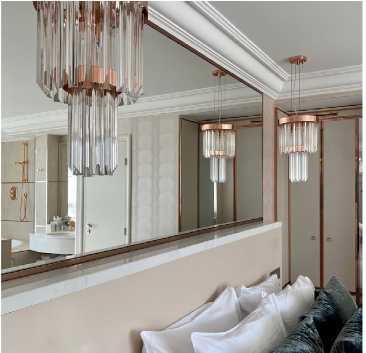
ROYAL PENDANT HOTEL PARIS J'ADORE, FRANCE