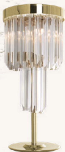
TABLE LAMP 9163.30

DIMENSIONS: H.50CM - Ø.30CM WEIGHT: NET 8KG BULBS: 3X G9 (3W) MATERIAL: BRASS & GLASS