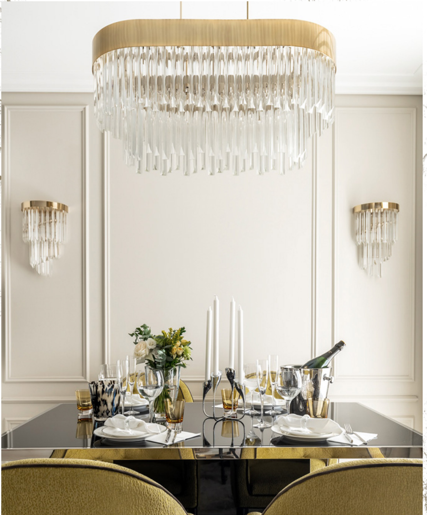
ROYAL SUSPENSION, ROYAL WALL LIGHT ALENA CHASHKINA, RUSSIA