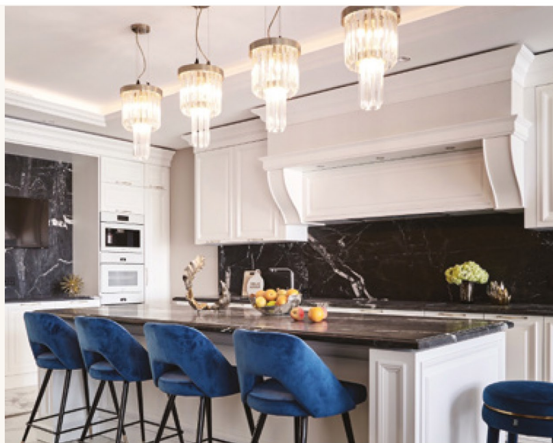
PROJECT BY: DOMOS DESIGN, RUSSIA

DIMENSIONS: H.55CM - Ø.40CM WEIGHT: NET 20KG BULBS: 6X G9 (3W) MATERIAL: BRASS & GLASS