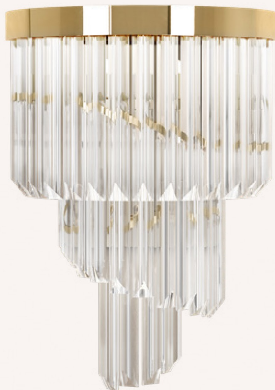
WALL LIGHT 9161.40

DIMENSIONS: H.55CM - W.40CM - D.25CM WEIGHT: NET 9,5KG BULBS: 5X G9 (3W) MATERIAL: BRASS & GLASS